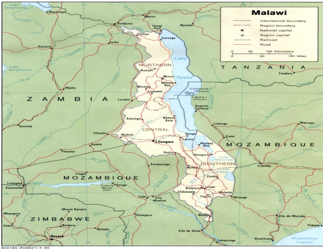
Figure 1: Map of Malawi

relatively low when compared to neighbouring countries in the region, such as Zimbabwe and South Africa.